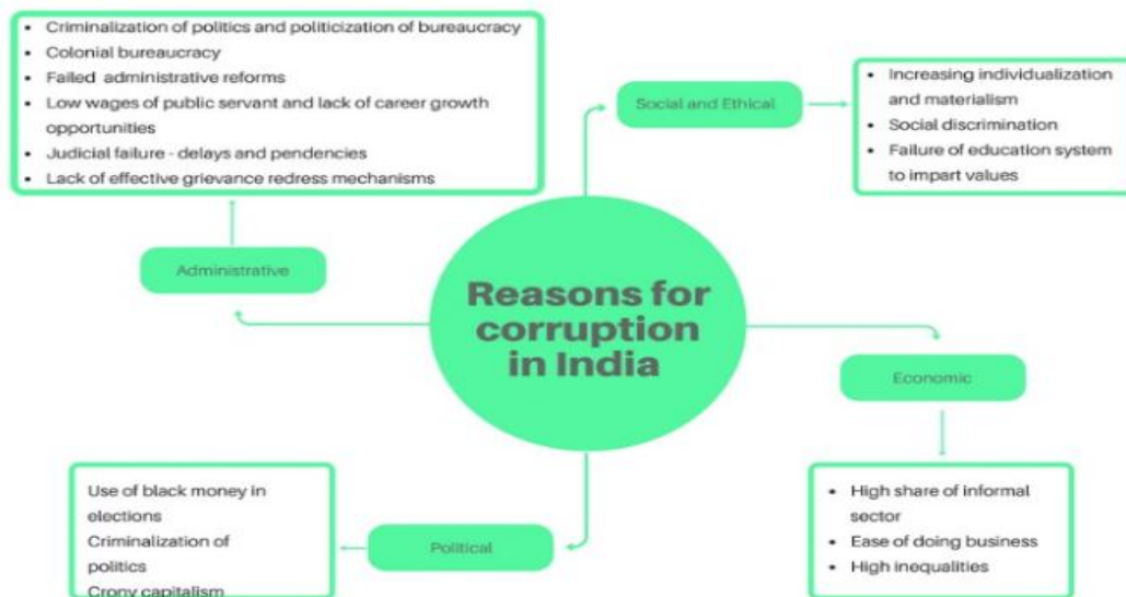
Figure 1: Reason for corruption in India

More than a few factors contribute to India's widespread corruption, including a lack of transparency in the bureaucracy and a government-controlled monopoly on certain industries. In recent years, a number of high-ranking governmental officials have been involved in major frauds. For example, the Coal Allotment Scam (Cost–186000 Crores), in which the Indian government was accused of inefficiently awarding coal blocks between 2004 and 2009, was one of the most significant scandals in India. The Commonwealth Games (CWG) Scam was another significant national fraud (Cost–70000 Crores). Indian sportspersons accounted for just half the amount awarded in this case, and the Swiss Timing company was accused of being given a contract at an excessively high fee of Rs. 95 crore, which was unreasonably inflated. There have been scams like the 2G Spectrum Scam, the Black Money Laundering Scam (Mega), the Adarsh Housing Scam, the Stamp Paper Scam (Bofors), the Fodder Scam (Bofors), the Hawala Scam (Satyam), and the Stock Market Scam (MadhuKoda scam).